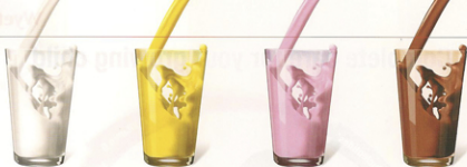
TABLE 3 : Recommended Servings of Milk